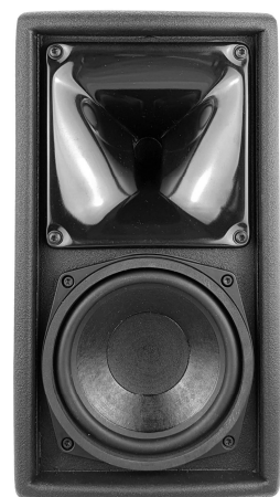
Grille removed, the large PS horn used with the HF driver

ePS6 acoustic phase response is NEXO phase signature allowing inter-operability between all NEXO speakers at all crossover points, except for the monitor setups where latency is minimized.